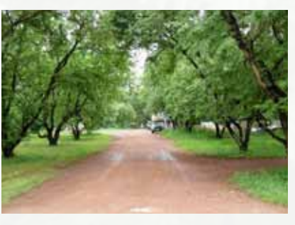
Entrance to the farm