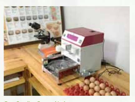
Egg Quality Control Laboratory