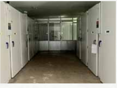
Interior view of the hatchery.